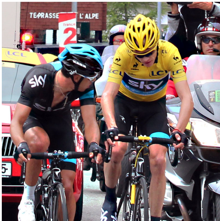
Chris Froome in trouble, 2nd trip up Alpe d'Huez