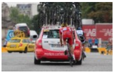
A pair of riders drafting behind cars to get back to the field after a crash