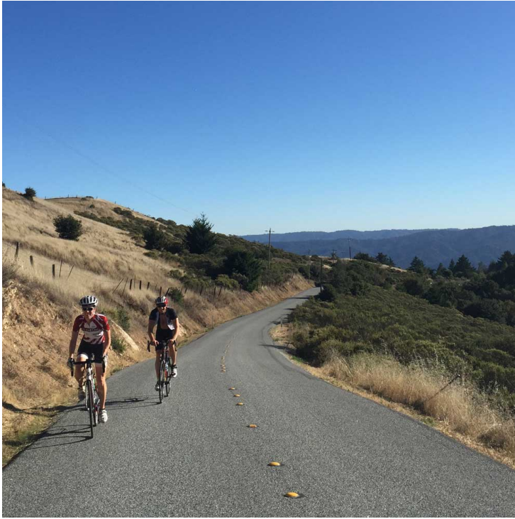
Riders heading up West Alpine