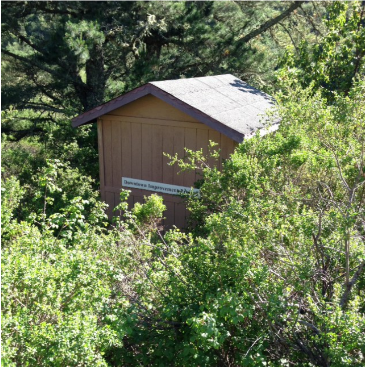
"Downtown Improvement Project" off West Old LaHonda