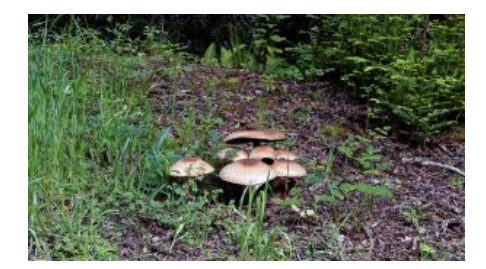
The gigantic mushrooms on Tunitas. Huge!

Nothing unusual about today's ride; Kevin & I probably do the Pescadero/Tunitas loop 15 times/year (OK, just checked, 22 times this past year, probably 19 of them with Kevin). There are at least 3 "reference" climbs en route; Old LaHonda, Haskins & Tunitas. You can't keep secrets from this ride; if you're not in shape, Strava knows all! But I went into the ride with a small amount of hope because I'm finally seeing my weight come down just a little bit, an indication that winter is on the way out. Yet as we approached Old La Honda I was telling Kevin it might not be a very fast ride up the hill. Just felt a bit like a "high gravity" day. Thankfully that turned out to be a mis-read of my body's tea leaves.