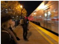
Catching the train to SFO

We're heading into Saturday night/Sunday morning right now, and a lot's gone on (nothing bad) while we've been here, but don't have the time right now to do all the updates. But I will post the same photos I've put up on FB, so you can get some idea of what the place is like. --Mike--